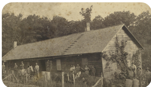
Marty-Eichelkraut Cheese Factory, ca. 1900