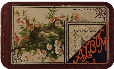
Oswald Kubly's autograph album, 1886.