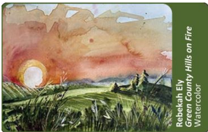
Rebekah Ely Green County Hills on Fire Watercolor

As part of their 90th anniversary celebration, the New Glarus Public Library now has limited-edition library cards designed by local artists.