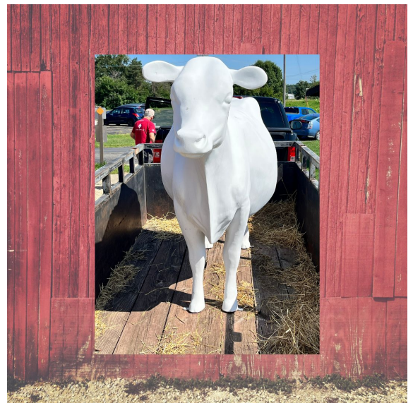
Buttercup the cow is in the process of being painted, and will soon be greeting visitors at the Entrance Building.