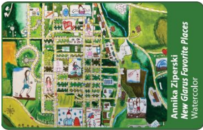
Annika Ziperski New Glarus Favorite Places Watercolor