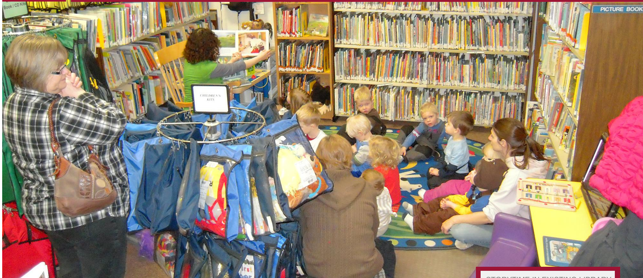
STORYTIME IN EXISTING LIBRARY